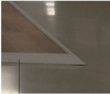
Raised floor (4cm) with sloping edges, finished with wooden laminate.

Click here to read the Safety information and required documents by the venue.